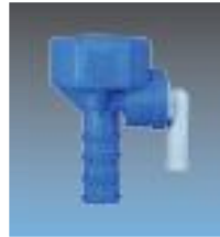
61-97 2.5 gpm proportioner