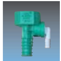
61-99-2 1 gpm proportioner