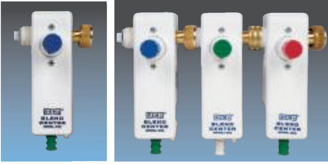
633GAP-B1 3 MODEL 633GAP UNITS SHOWN COUPLED TOGETHER

Blend Center's modular design lets you easily couple together any number of stations to create any system to meet your needs. Mix and match bottle and bucket fill and choose from blue, red, green, yellow, black, or white buttons. Models listed include Action Gap backflow. Use AG instead of GAP for air gap.