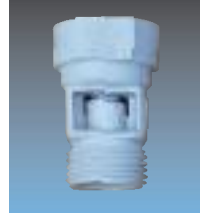
16-30 Action Gap backflow preventer

All Dema housekeeping dispensers use the same proportioners, backflow preventors and metering tips. Proportioners are available with flow rates of 4gpm (15L), 2.5gpm (9.5L) and 1 gpm (4L). Standard proportioners are equipped with ASSE 1055 approved 16-30 Action Gap backflow preventors. Air gap backflow prevention is available with a 4 and 1 gpm proportioner.