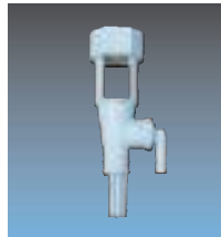
61-22-3BAG 4 gpm air gap proportioner