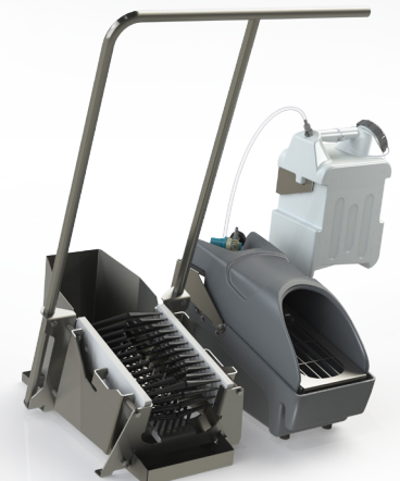
Item Number: SS2-MBS